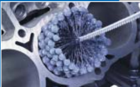
Surface finish of a cylinder bore...